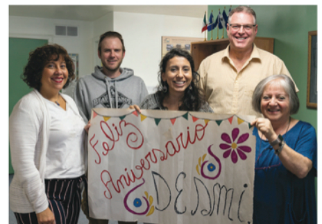
A group of Horizons' staff members congratulate our Mexican partner DESMI on their 50th anniversary.