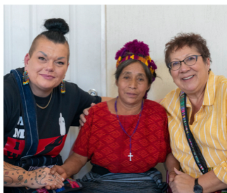
Indigenous women living in Canada share stories with a Maya K'iche' midwife from Guatemala.

As part of our Maternal, Newborn, and Child Health (MNCH) project, 7 Anishinaabe, Cree, Inuit, Mohawk and Oji-Cree women joined Horizons in Guatemala for a knowledge exchange with our Maya K'iche' partners, community leaders and comadronas.